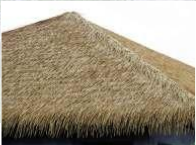
LOVING FARM, Indonesia