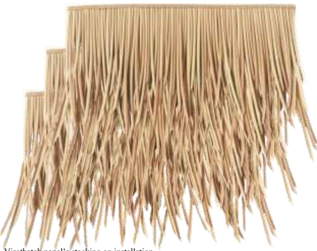
Virothatch panel's stacking on installation