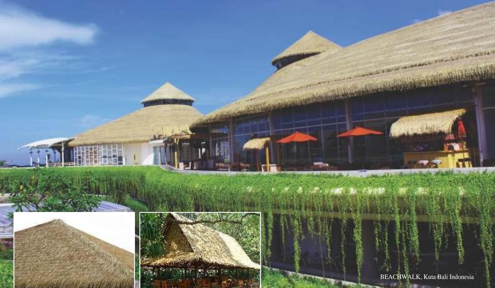
BEACHWALK, Kuta Bali Indonesia