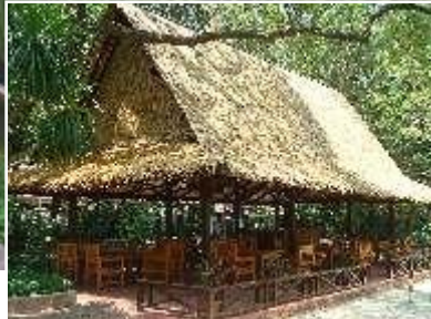
POLO CLUB, Thailand