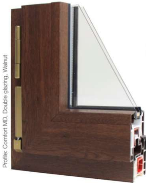
Profile: Comfort MD, Double glazing, Walnut

All options fulfill European standards for Energy saving requirements and security.