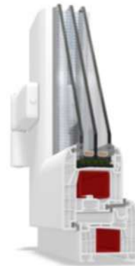
Forte Out 70mm